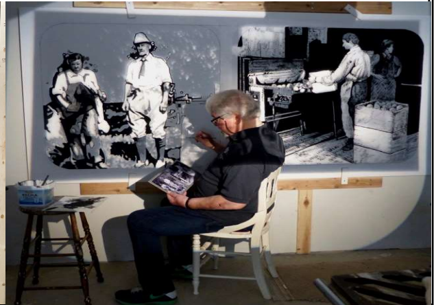
Work of art - - in progress!!!