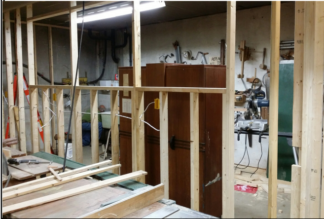
What comes down—must go back up!!