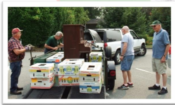
A visitor from Holland came in and asked to play the piano. She was as good as can be expected from an old maybe slightly out of tune piano. Helpers – Carel, Mick,

Our atmosphere seems more relaxed and determined at the same time. Our museum looks better with all the murals up and exhibit areas enhanced such as the Maytag wash house simulation for live demonstrations on Event days. The place has come alive with the sounds of a player piano, how cool is that? (There are 700 rolls of music to choose from!)