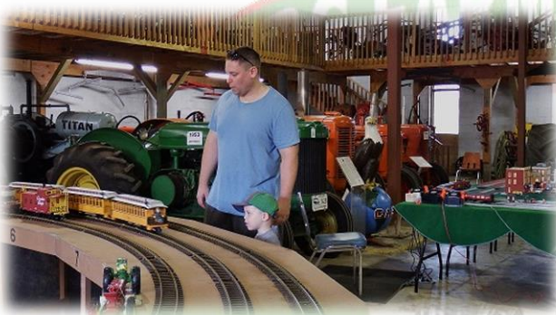
B C / Train Day

The past year has been a busy one with all the events and activities planned, worked on and executed. The parade, Canada Day, presentations of slide shows to two Seniors Activity Centres, Langley Farmers Market, Train day with old and new things on BC Day, a talk by Fred Pepin and myself at the Annand Rowllatt farmstead with Shelly Broeckx shooting videos and taking pictures.