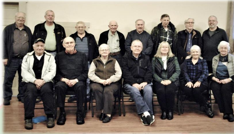
Board Members for 2020 L to R